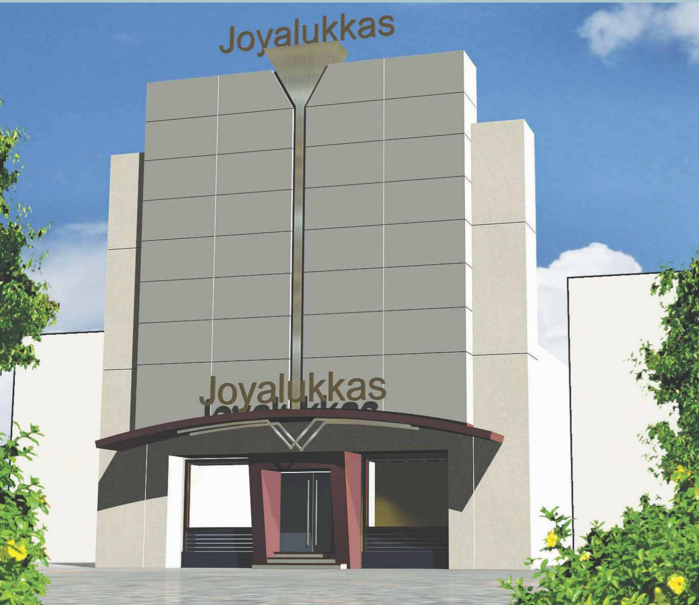
Joy Alukkas Jewellery Mall, Thrissur