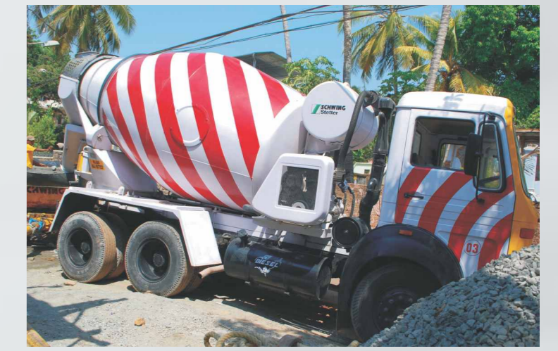
Vadakkumnathan Apartments Under the stage of Construction