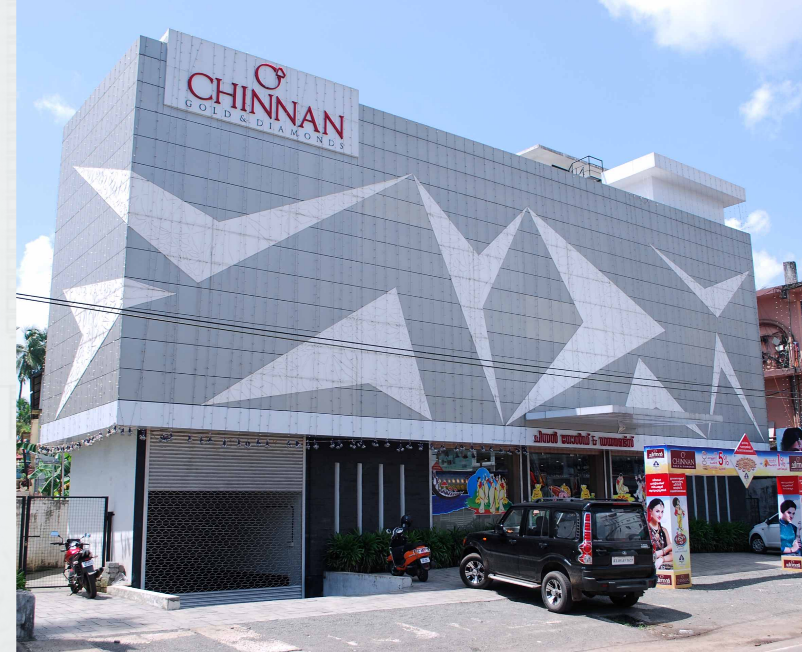
Chinnan Gold & Diamonds, Thrissur