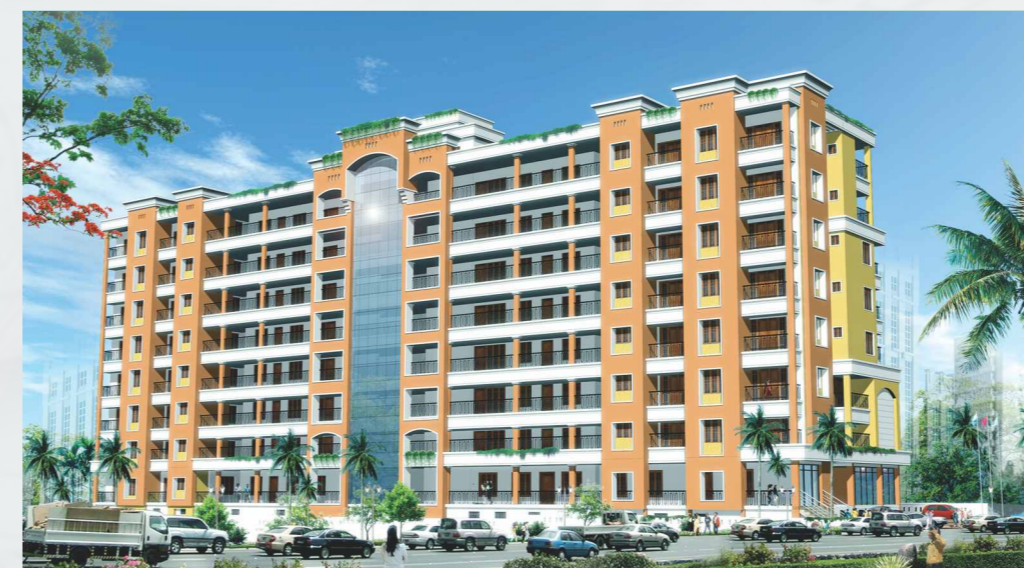
Agnel Homes, Ollur