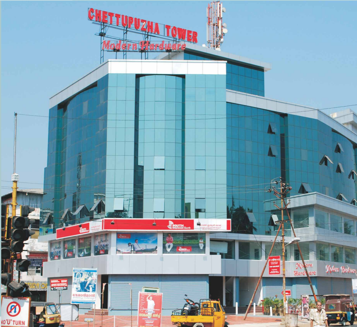
Chettupuzha Towers, M.G. Road, Thrissur