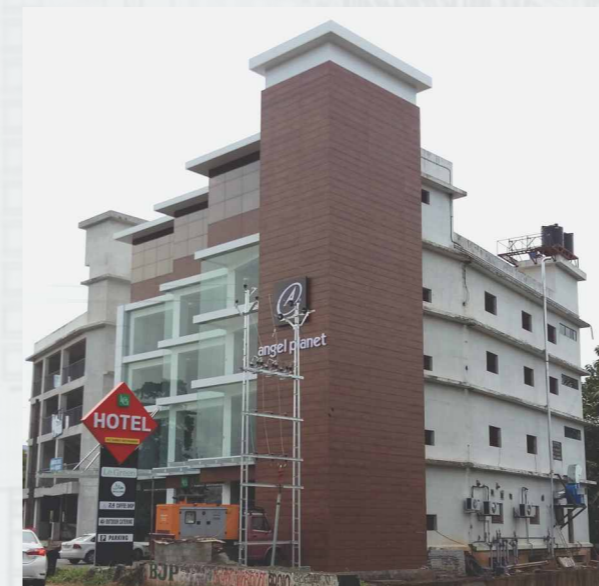
Angel Planet, Puzhakkal