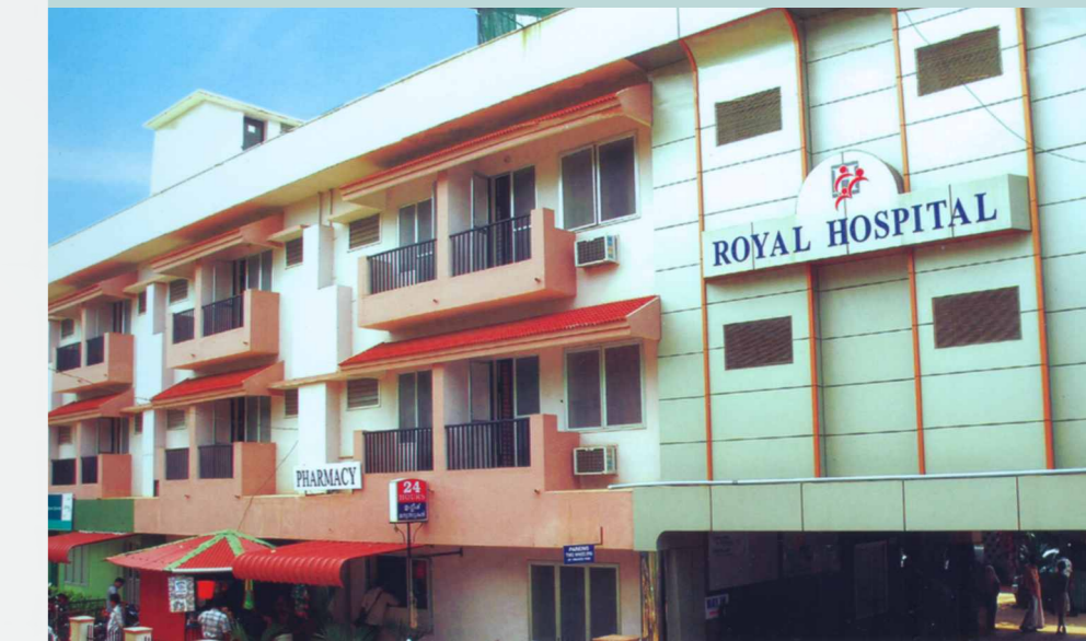
Royal Hospital, Kunnankulam