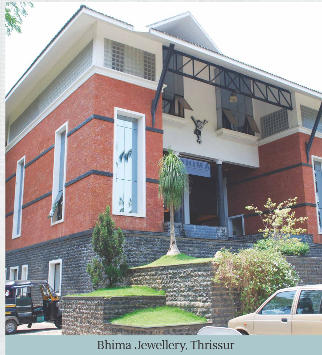
Bhima Jewellery, Thrissur