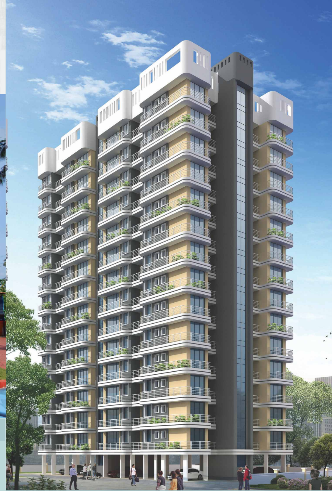
Krishnakripa Flat Guruvayur (ongoing project)