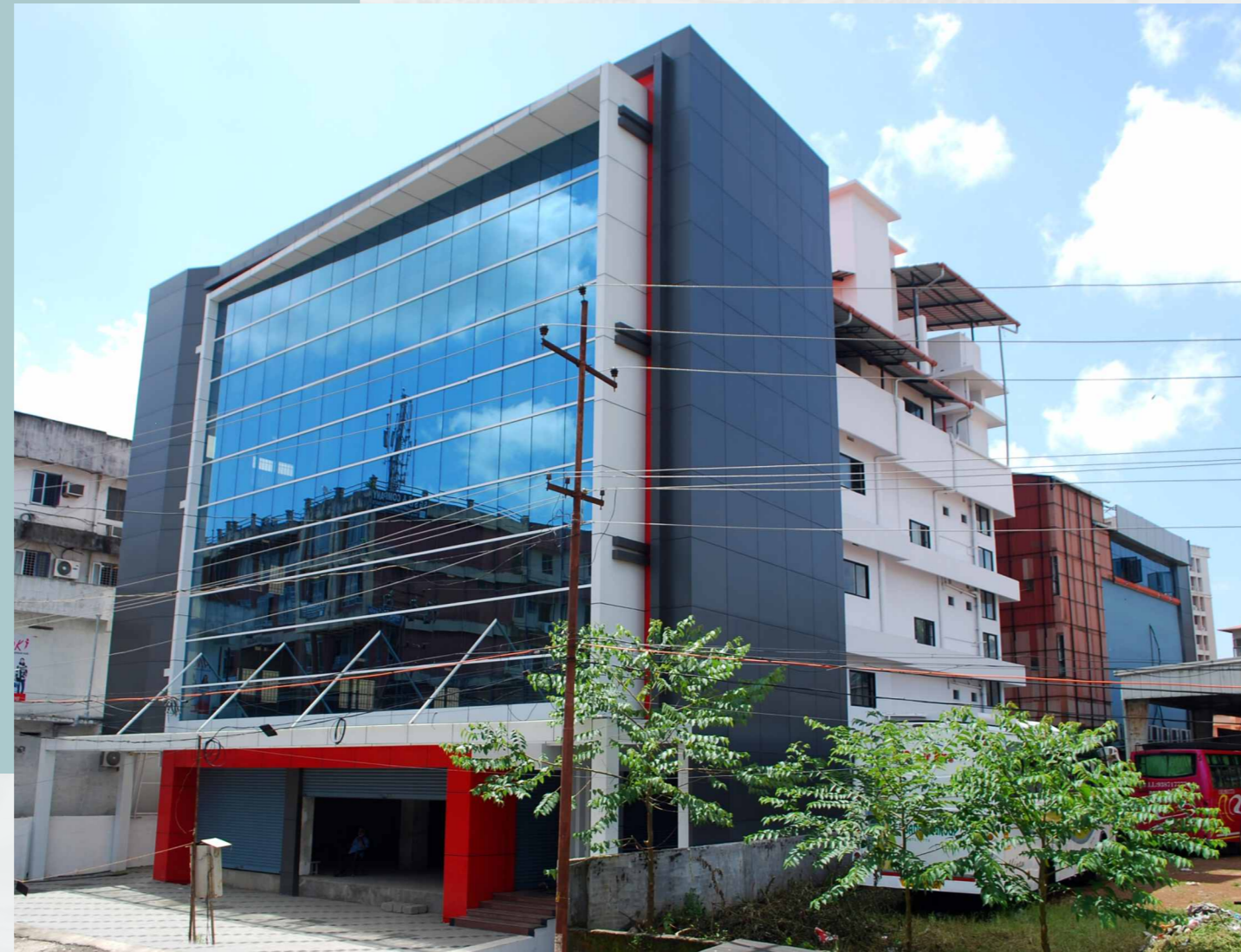
Sadananda Tower, Adam Bazar