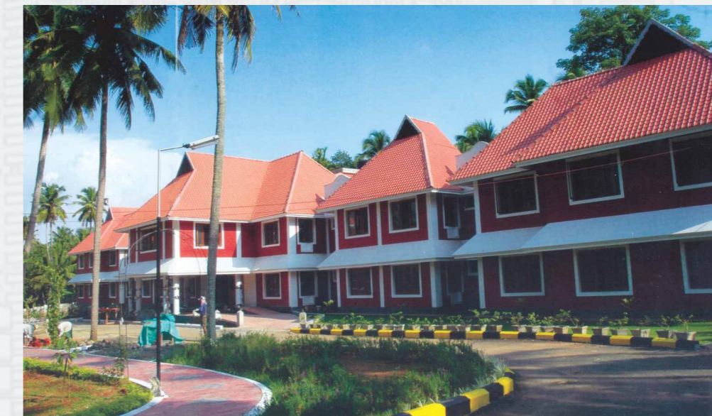
Soplanam Resorts, Irinjalakuda