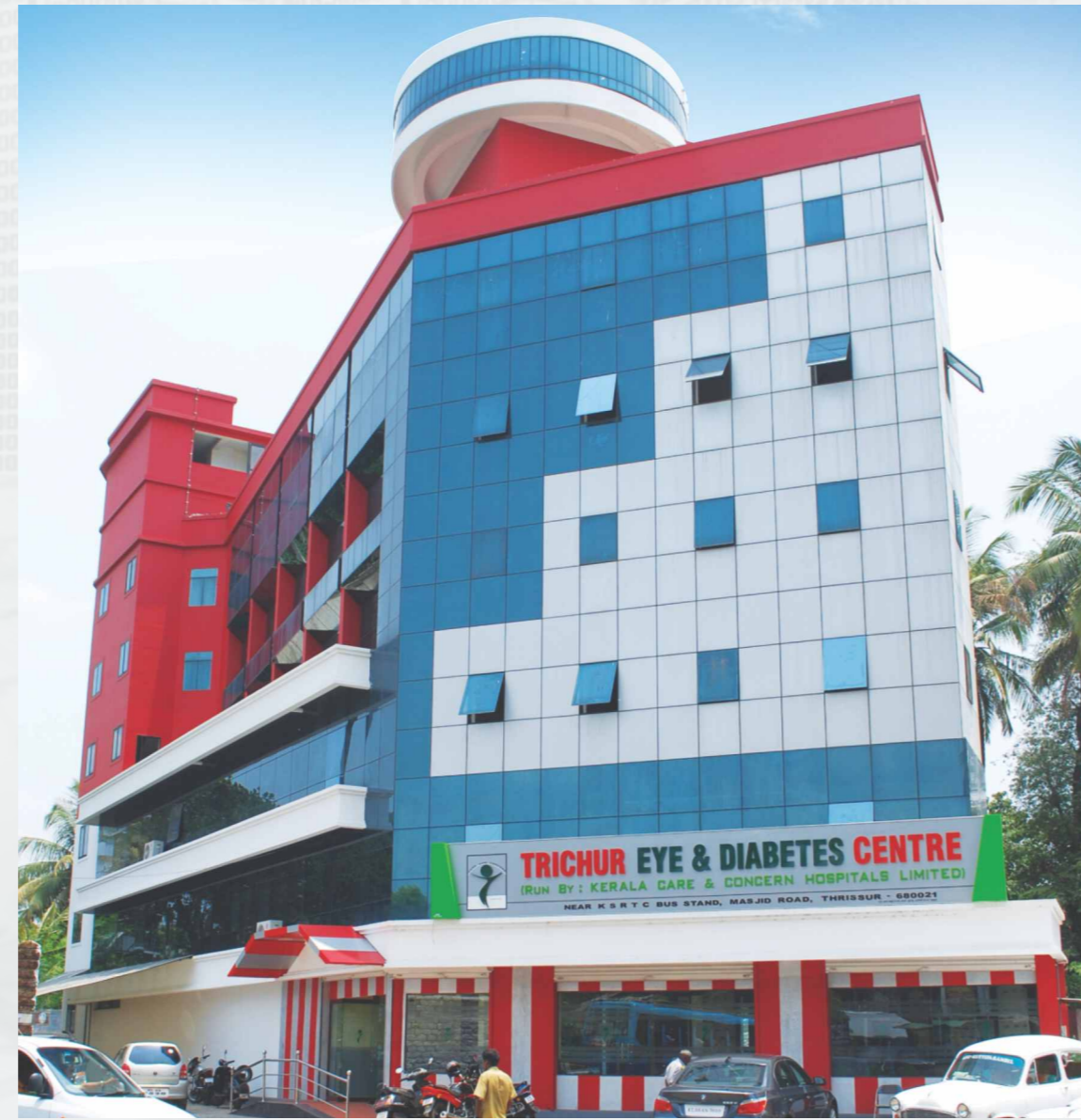
Shanshad Regency, Commercial Complex, Thrissur