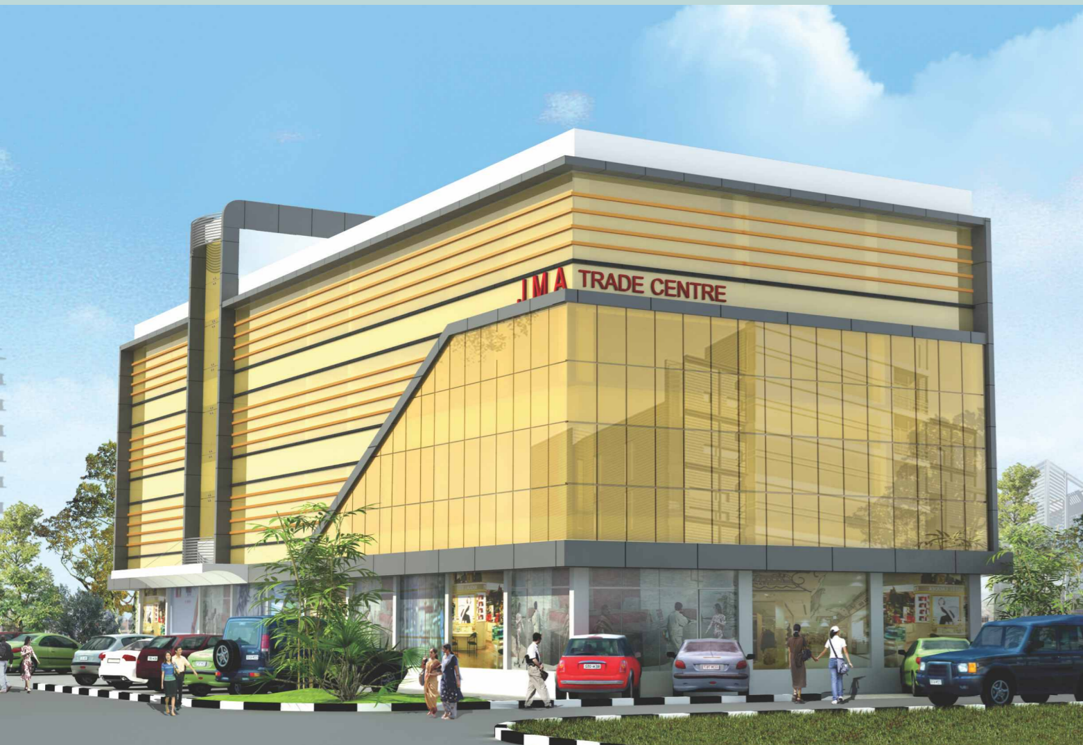
JMA Trade Center, Thrissur