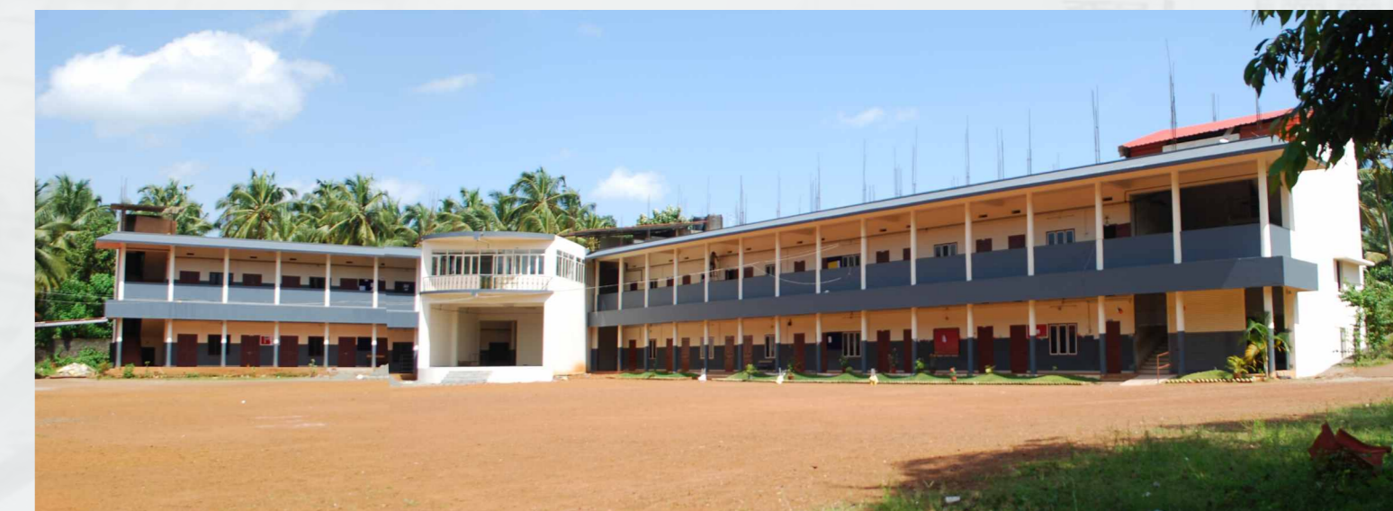
B.V.P. School, Adattu