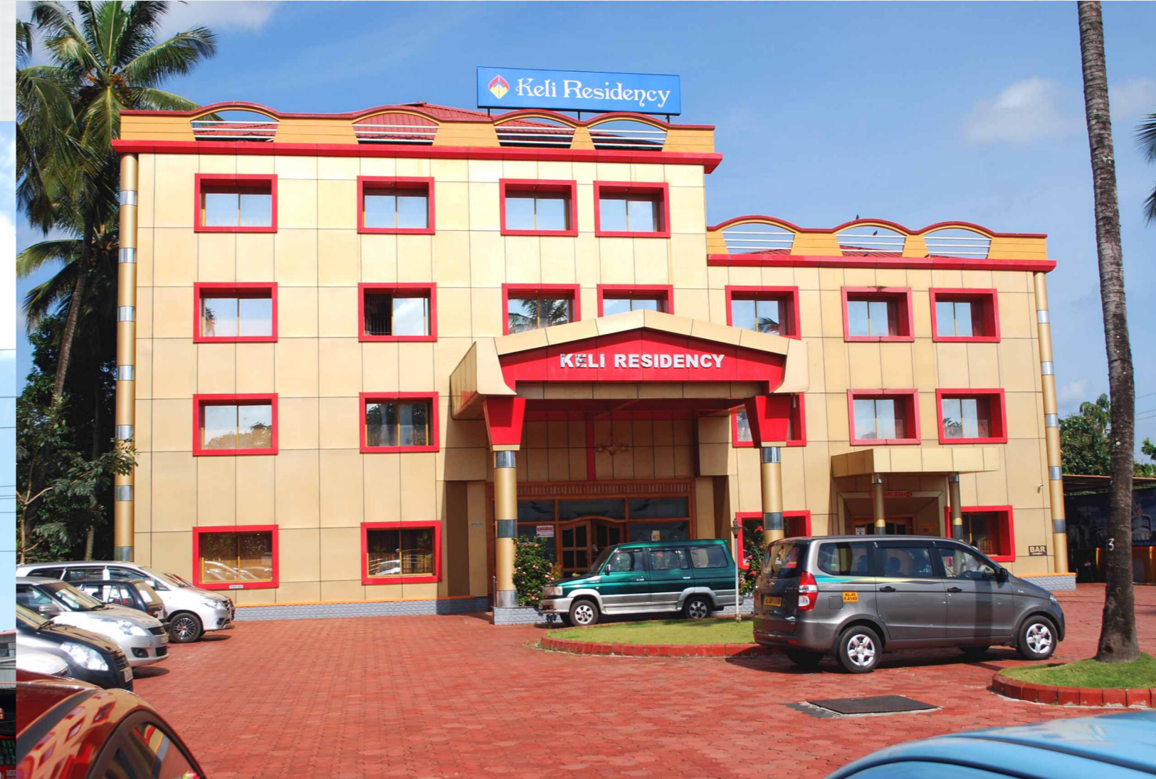
Keli Residency, Athani